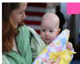
New Mom and Baby Waiting for New Daddy

You truly live out Gal 3:6 and do everything as unto the Lord.