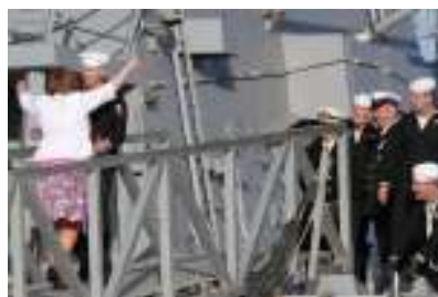
First Kiss on the USS Momsen

For those who don’t know Christ this is even more challenging. Their hope is found in phone calls, e-mails and a short-lived welcome home. For those who do know Jesus we’ve had the opportunity to help them see how faith in